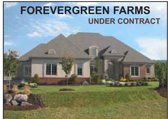
2 Tannenbaum Circle | Dillsburg, PA

Roland Builder, Inc. is pleased to recognize the entire team at Kountry Kraft as our featured Subcontractor. ■